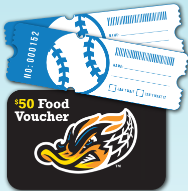
4 Rubber Duck Tickets with $50 Food Voucher