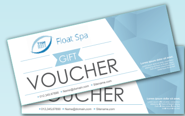
2 Float Spa Vouchers