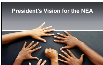
President's Vision for the NEA

created a welcoming, organized, and fun event for everyone who attended President Biden's labor address at the NEA building. It was noted and appreciated by leaders of the other unions who attended.