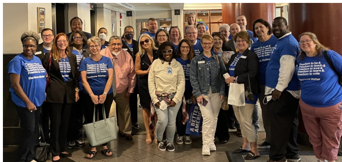
30 NEA Directors prepare to head to White House for Elton John concert.