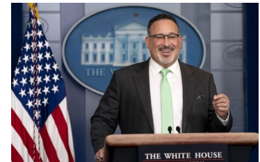
Secretary Miguel Cardona

Secretary of Education Miguel Cardona released a letter in September 2022. He writes, "The purpose of this letter is to remind all who report and interpret student outcomes this year that assessment data has always been meant to be used constructively—to help inform parents and families about their students' schools and to ensure schools receive the necessary resources to help support students. Further, this letter is intended to support our communities in countering efforts to misuse these results by applying them punitively".