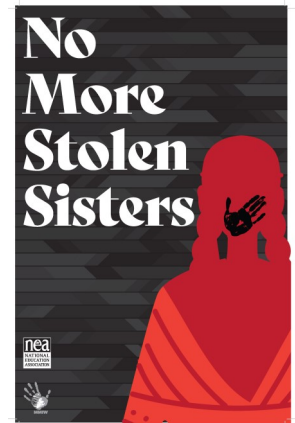
Native American and Alaska Native Heritage Month Resources

One method for engaging these eligible voters in Oklahoma is focus groups, identifying important issues to those 18-24 years old. Their priorities include civil rights, police brutality, climate change, mental health, missing and murdered indigenous people, and student loan debt. Their work with youth took them to various college campuses, where they registered first-time voters.