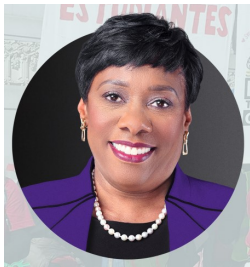
President Becky Pringle

President Pringle urged the NEA Board to steep its work in the mission and vision of the organization and to articulate objectives for the work that can be revisited later. She congratulated Directors for the comments she received from partner labor organizations after the Biden event. The work staff and leaders