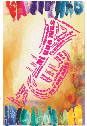
NEA Hispanic Heritage Poster & Resources

She reminded NEA Directors of what her grandfather once said: "Once social change begins, it cannot be reversed. You cannot uneducate the person who has learned to read. You cannot humiliate the person who feels pride. You cannot oppress the people who are not afraid anymore."